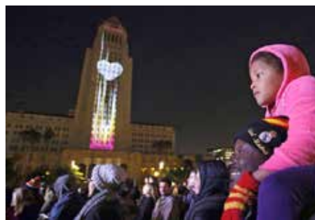
Peace & Justice in 2016!

New Year's Eve free concert, Grand Park, downtown LA, 7p-1a Jan1. Count down to 2015 with friends, sweeties, cousins, and neighbors in a New Year's Eve celebration with live music, food, photo booths, and huge projections that captivate the imagination. Come early - last year they overfilled the cordoned off park to see the live stage show and projections -- the Red Line was packed. www.facebook.com/events/492722737493010/#NYELA